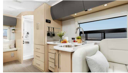
Sierra Maple Shown w/ Glamour Upgrade