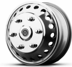
Steel Standard – With Wheel Simulators