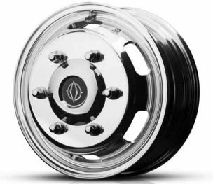
Alcoa Dura-Bright® Aluminum Optional – All 6 Aluminum Wheels, 4 Dura-Bright® Wheels