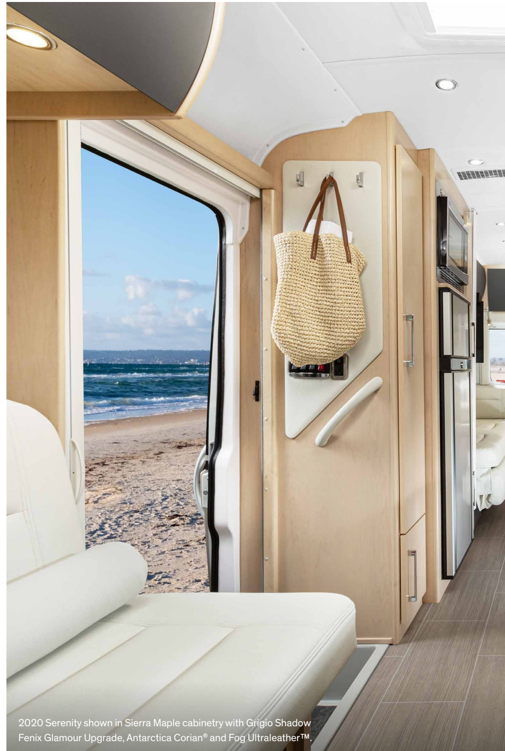
2020 Serenity shown in Sierra Maple cabinetry with Grigio Shadow Fenix Glamour Upgrade, Antarctica Corian® and Fog Ultraleather™.