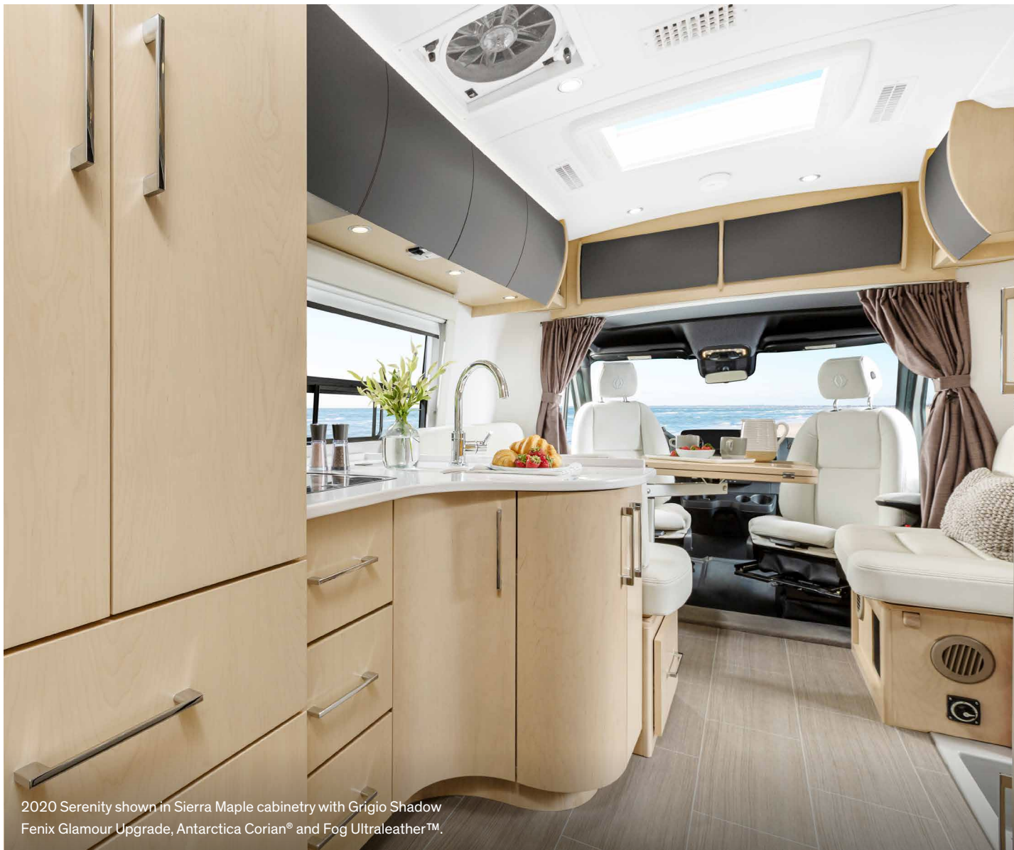
2020 Serenity shown in Sierra Maple cabinetry with Grigio Shadow Fenix Glamour Upgrade, Antarctica Corian® and Fog Ultraleather™.