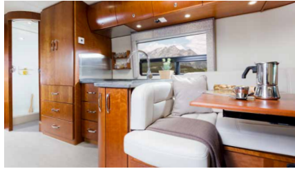
Chestnut Cherry Available w/ Glamour Upgrade Previous Year Model Shown