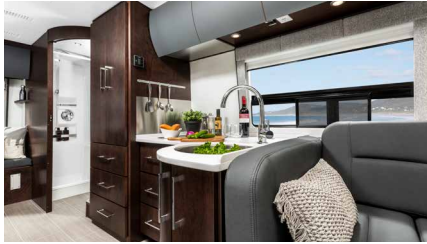
Espresso Brown Shown w/ Glamour Upgrade Previous Year Model Shown