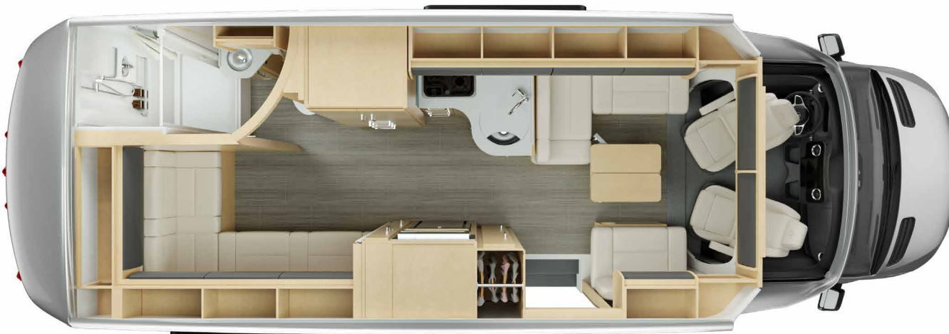
Optional Rear Power Trifold Sofa/Bed